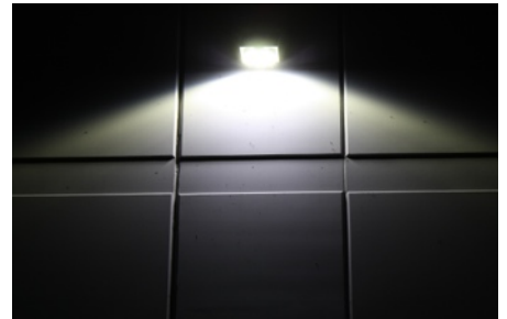
G2-6 Wall Pack Retrofit Kits